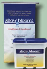
50-lb bag 40-lb pail