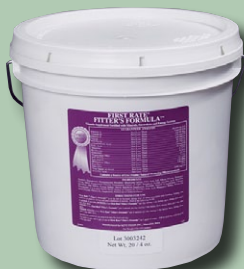
20-4 oz. packets

Feed at the above rate along with a daily ration.