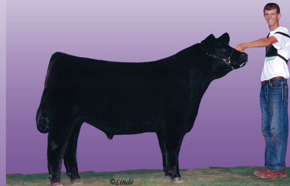
©Linde Tyler Faber Grand Champion 4-H Market Steer 2010 Iowa State Fair